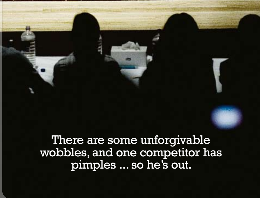
There are some unforgivable wobbles, and one competitor has pimples ... so he's out.