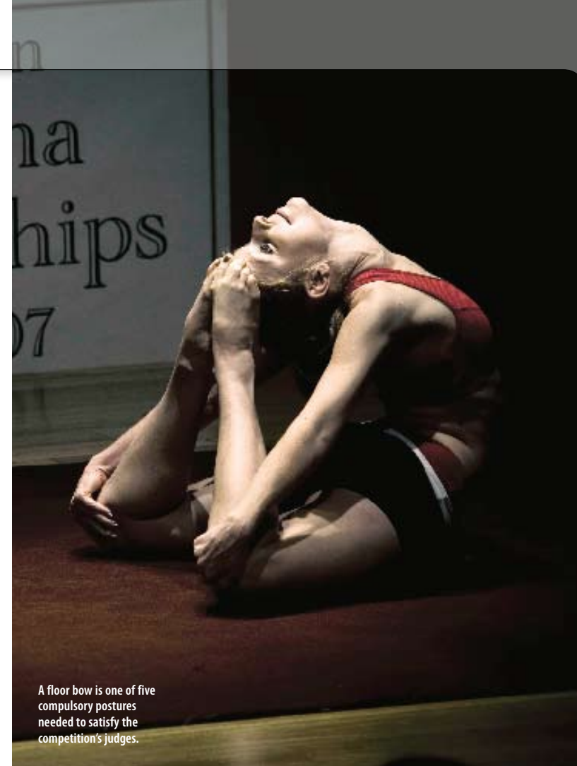
A floor bow is one of five compulsory postures needed to satisfy the competition's judges.